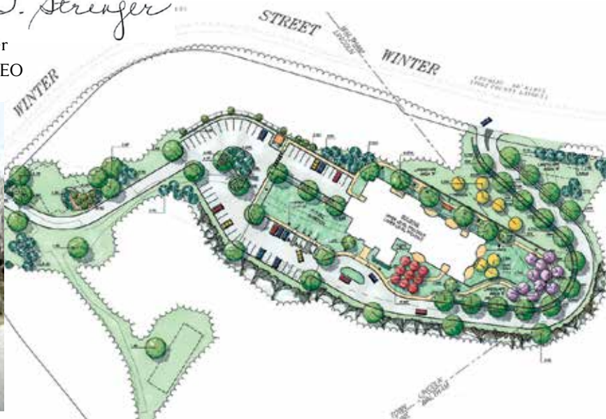
Planned 18-bed, inpatient hospice facility featuring private suites, including two pediatric rooms, with views of the gardens and natural surroundings of a 12-acre parcel of land located on the Lincoln/Waltham town line.