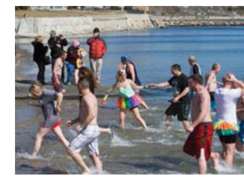
The Annual Anchor Dip, sponsored by the Anchor Pub & Grille and Jubilee Yacht Club in Beverly, raised $13,046 for another successful fundraiser.